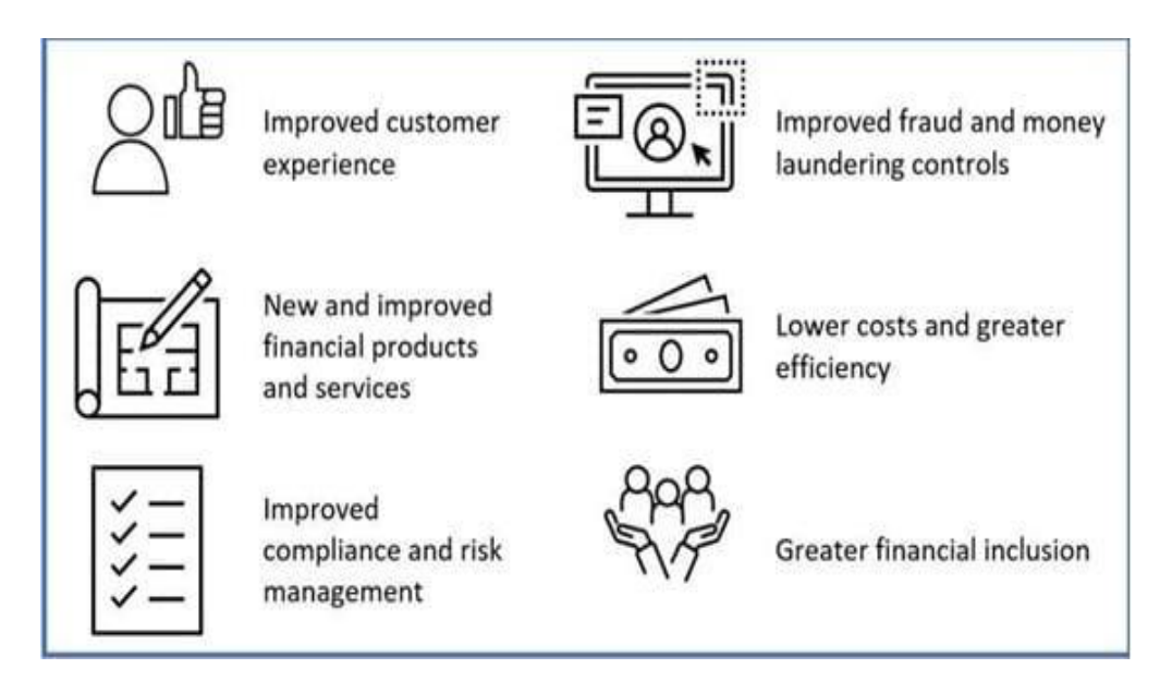
FIGURE 2 PROJECT DOCUMENTS OF THESE PROGRAMMES IMPORTANT FINDINGS

The US agency for international development (USAID) in collaboration with (FHI 360, IFMR-LEAD and Intellecap) committed in recent past that it will support Government of India financial inclusion drive in India for focused expansion of digital services of merchants through payment merchant services across underdeveloped regions of India to have more coverage of Financial Inclusion. USAID has set up various programmes for urban and rural areas across Haryana, Rajasthan and Uttar Pradesh as a CATALYST program looking at the value chain-based approaches. Based on the project documents of these programmes important findings include: